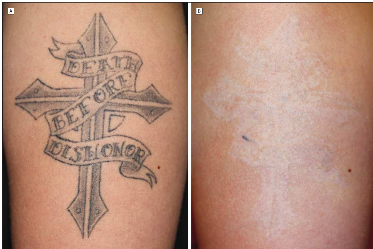
Figure 1. Tattoo treatment. A, Prior to treatment the tattoo consist of a single dark color, which is ideal for treatment. B, After 4 treatments delivered over 4 months, there was greater than 75% clearance.

ber of treatments to clearing compared with historical controls.